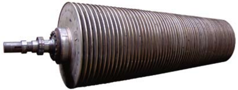
Discor shaft with rotary discs.