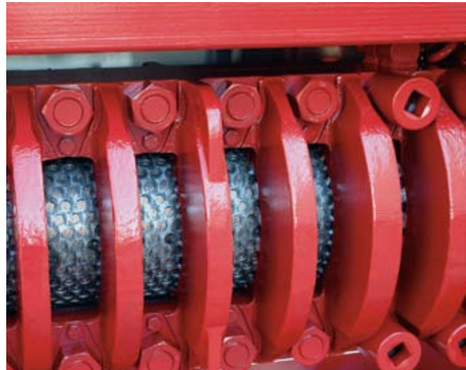
The Pressor for Hydrolyzed Feathers features screens that are easy to access and maintain.

Versatile new feather press is compact and easy to maintain. Efficiently adapts to your product and throughput specifications.