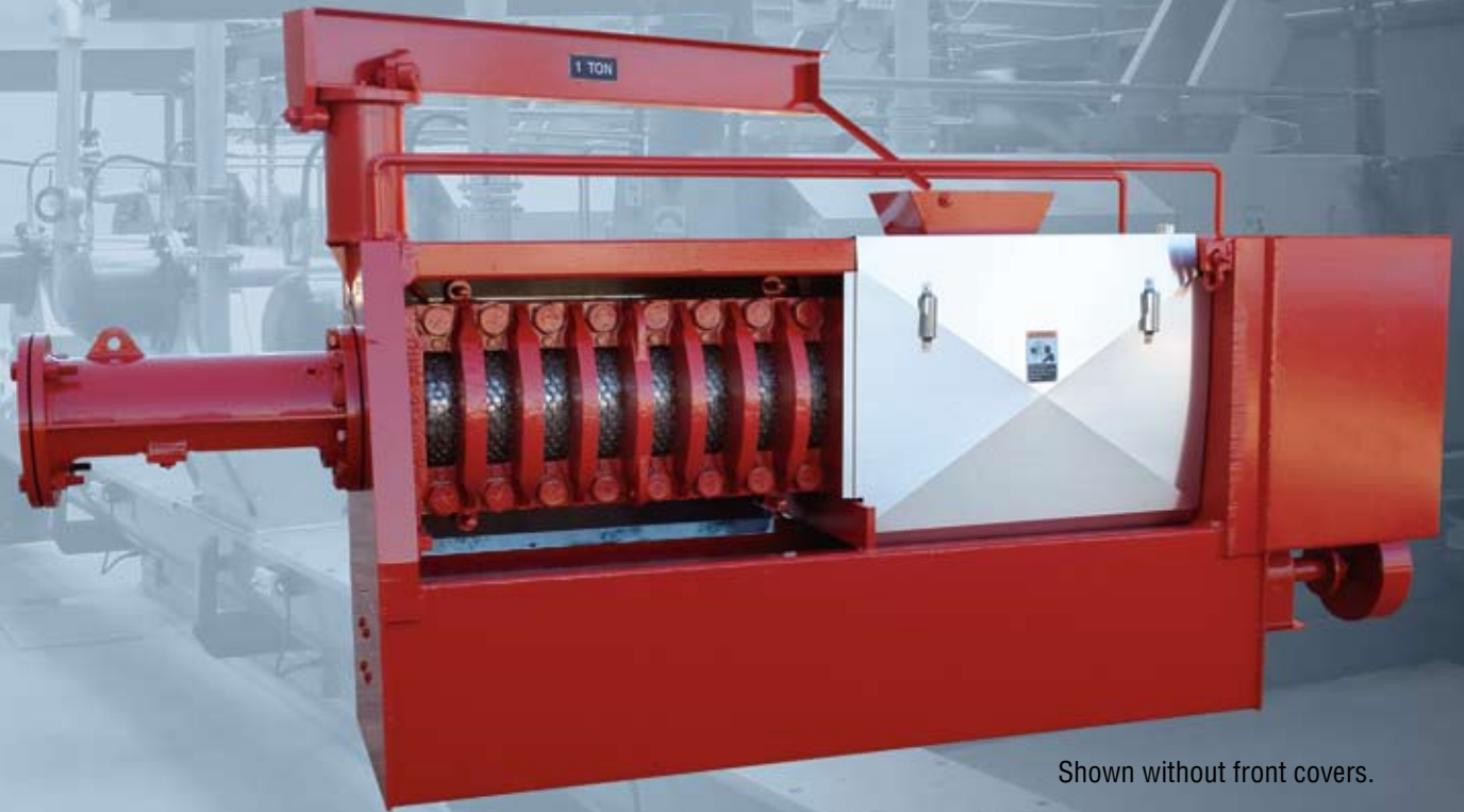
Shown without front covers.