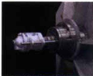
ASME coded shaft is standard