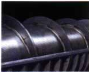
Replaceable wear plates on tapered stainless steel screw shaft