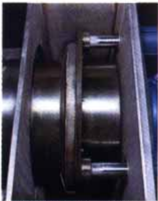
Air-actuated choke for less maintenance, better control than spring-actuated designs